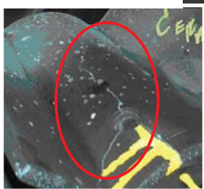
Silicon carbide spreader