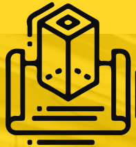
Design optimization and rapid prototyping