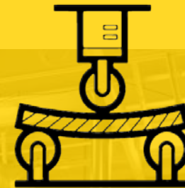
Post-print processing and qualification