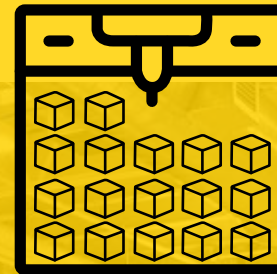
Printed production components