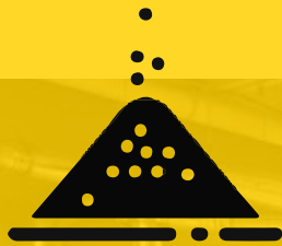
Differentiated metal powders